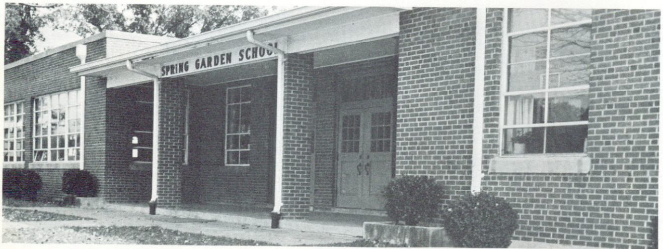
The school takes on a "new look" with the addition to the front.