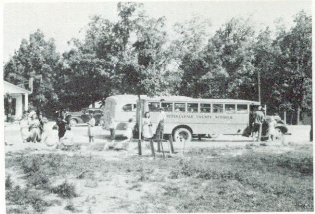
Students are getting into one of the busses which will carry them home.

In 1934 the old frame building was torn down and the materials were used to build a Home Economics Cottage, an Agricultural Building, and a custodian's house. The Home Ec. Cottage was sparsely furnished, and the students used a wood cook stove. A coal heater was used for heating. Many changes have been made during the past 18 years. A floor furnace, a hot water heater, an electric stove, refrigerator, and an automatic washer were installed. Bathroom fixtures were added, kitchen cabinets built. The young Farmers and Young Homemakers tore out the walls and put on sheet rock, added florescent lights, and sanded and refinished the floors. New sewing equipment has also been added and the old has been replaced.